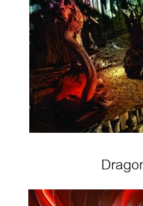
Dragon Cave Room