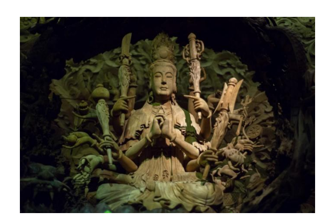
Guan Im Room