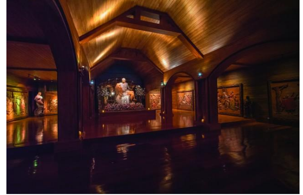
Buddha Room Catholic Room