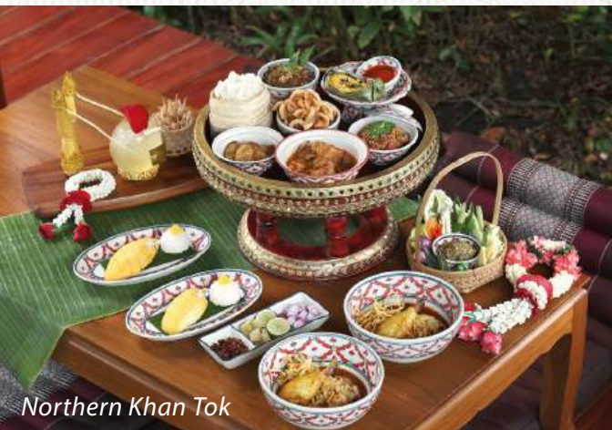
Northern Khan Tok

Available Friday to Sunday from 6:30pm to 9pm.