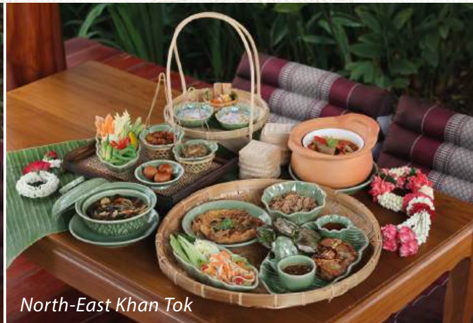
North-East Khan Tok