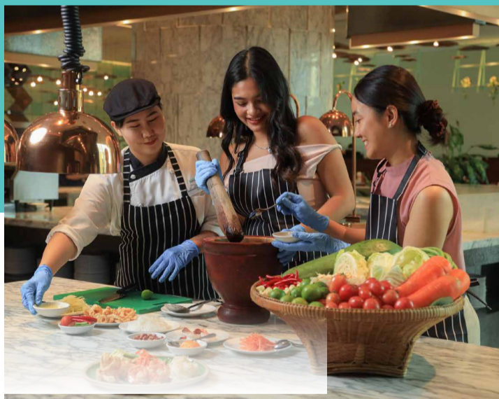
Thai Cooking Class with our Thai Chef Starts from THB 1,600 net per person

Make your stay at Le Méridien Bangkok memorable with these experiences