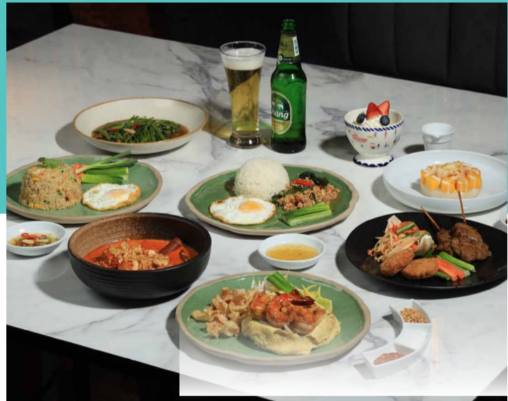
Authentic Thai & Chinese Set Menu at Tempo THB 1,200 net for 01 person